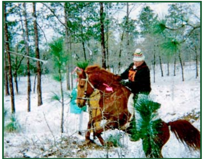
Uphill Obstacle at Spanish Trail in the 1993 snow