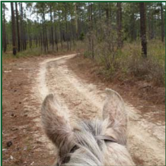
Trail of the Long Leaf Pines