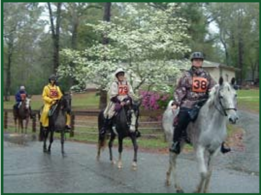
Spanish Trail (left) 2009 in the rain and (right) 2003 in the snow